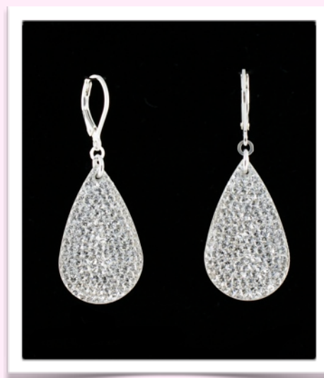
SN1122 - $101.00

Approx. 2 inches, sterling silver lever back earrings. Pave set Swarovski crystals with 12 mm AAA cubic zirconia accents.