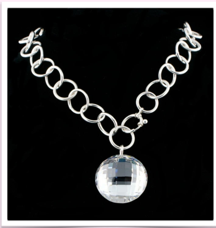
SN1127 - $396.00

Approx. 1.5 inches, 12 mm and 16 mm checker board circle AAA cubic zirconia. All sterling silver