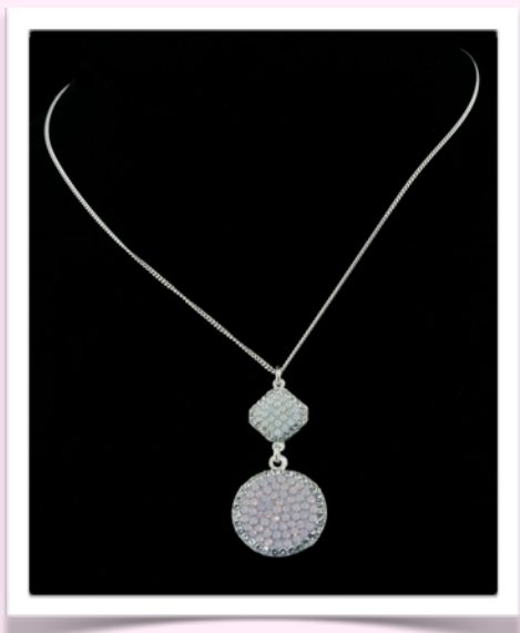
SN1143 - $101.00

16 inch sterling silver chain extends to 19. 10 mm Hexagon and 18 mm circle, rose opal and white opal crystals flown in from Swarovski in Austria - Exclusive to KLD. All pave set shapes are double sided for double the beauty. Available in most colours on the Swarovski colour chart at the back of the catalogue.