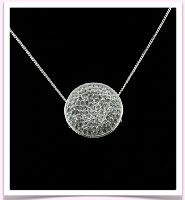
SN1112 - $59.00

16 inch sterling silver chain that extends to 18, with Swarovski crystals embedded in a 21 mm pendant. Available in most colours on Swarovski colour chart at the back of the catalogue.