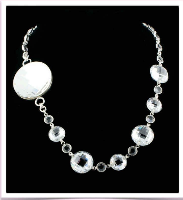
SN1125 - $290.00

16 Inches extends to 19. 12 mm and 16 mm checker board circle AAA cubic zirconia with channel set Swarovski chain. 30 mm Accent bead with the new checker board Swarovski cabachon and on the other side Swarovski pave set stones.