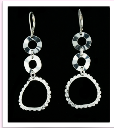
SN1150 - $70.00

Approx. 1.5 inches, all sterling silver 14 mm & 24 mm hammered discs.