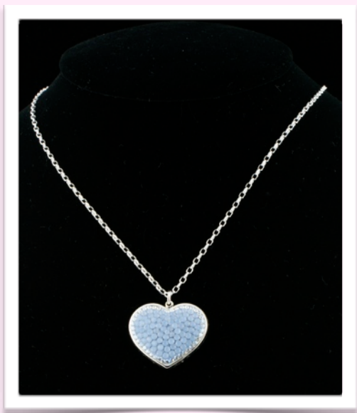
SN1105 FRONT - $75.00

Sterling silver extends to 19 inches. 28mm Heart with air blue opal crystals flown in from Swarovski in Austria - Exclusive to KLD. This pendant can be worn with colour on one side ex: Air blue and the other side clear pave Swarovski stones, 2 looks for the price of one. Available in most colours on Swarovski colour chart at the back of the catalogue.