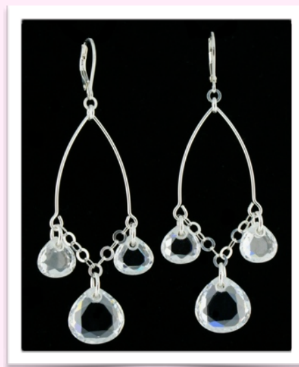
SN1124 - $88.00

Approx. 2 Inches. Swarovski crystal pave teardrops with sterling silver lever earrings. Available in most colours listed on the last page of catalogue.