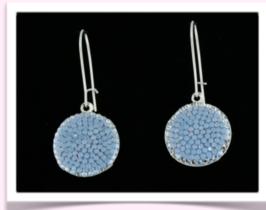
SN1109 - $92.00

Sterling silver 36 inch lacy chain that converts to 18 inches. Tear is Approx. 50mm, pave set air blue opal crystals from Swarovski in Austria - Exclusive to KLD. Available in most colours on Swarovski colour chart at the back of the catalogue.