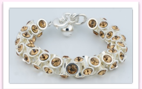
Lt. Colorado Topaz