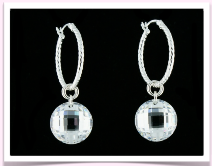
SN1128 - $70.00

18 Inches. 30 mm Checker board circle AAA cubic zirconia. All Sterling Silver.