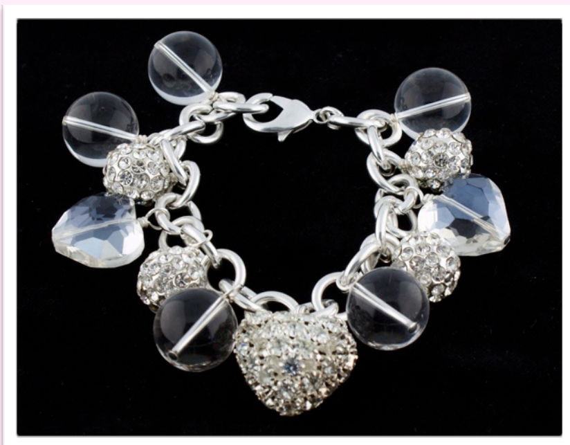
SN1160 - $88.00

Preciosa 12 mm crystals with rhinestone heart and findings. Available in aqua, lt. rose, jet, clear (shown), clear ab, lt. colorado topaz, tanzanite, jonquil and peridot.