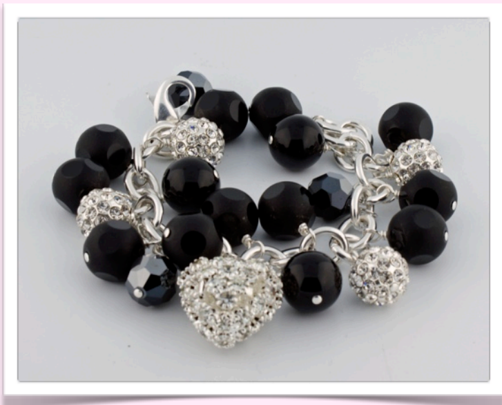
SN1170 - $92.00

7 Inches extends to 8. 12 mm Preciosa crystals, 16 mm silver acrylic round beads and 14 mm black onyx. All sterling fill. Available in all silver, clear and clear ab.