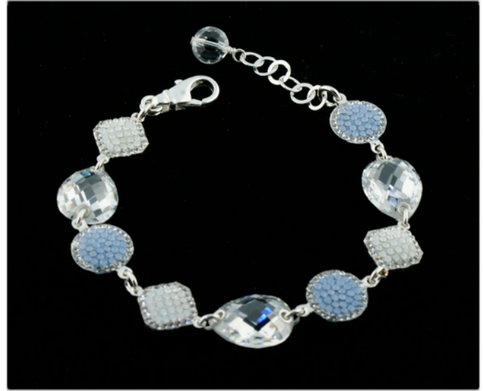
SN1102 - $290.00

Sterling silver, extends to 19 inches. Tear shaped AAA cubic zirconia with sterling rivets. Air blue opal and white opal crystals from Swarovski in Austria - Exclusive to KLD. Available in most colours on Swarovski colour chart at the back of the catalogue.