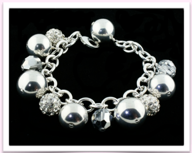
SN1154 - $92.00

Approx 56 inches. Sterling silver ball chain. Silver plated acrylic 16 mm balls with 12 mm and 14 mm Preciosa crystals