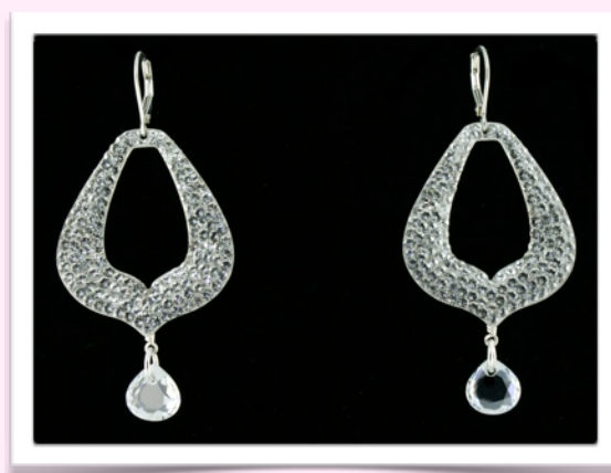
SN1121 - $162.00

Approx. 2 inches, 12mm diamond and checker board circles with 14mm diamond cut tears.