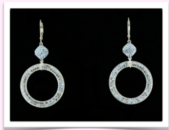
SN1157 - $134.00

Approx. 2.5 inches. Swarovski crystal hoops with 12 mm pave Swarovski set hexagons. All pave set shapes are double sided for double the beauty. Sterling silver lever back earrings. Available in most colours on the Swarovski colour chart at the back of the catalogue.