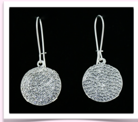
SN1109 - $92.00