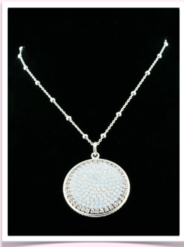
SN1111 - $189.00 Shown in White opal

16 inch sterling silver chain that extends to 18, with Swarovski crystals embedded in a 21 mm pendant. Available in most colours on Swarovski colour chart at the back of the catalogue.