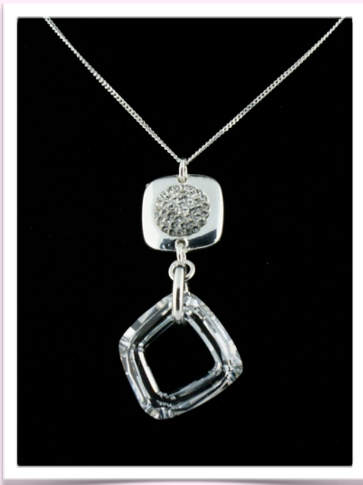
SN1138 - $85.00

Swarovski pave filled squares with 16 mm cubic zirconia baguettes, all sterling silver. Available in clear (shown), clear ab, lt. blue, lt. rose, yellow and peridot.