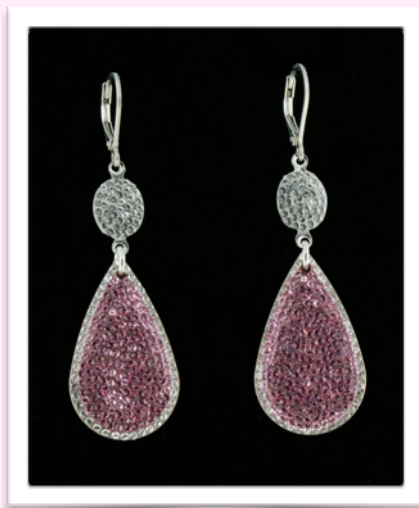
SN1147 - $189.00

30mm Sterling silver open diamonds with 10 mm Swarovski pave set Hexagons All pave set shapes are double sided for double the beauty. Available in most colours on the Swarovski colour chart at the back of the catalogue.