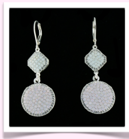
SN1144 - $171.00

16 inch sterling silver chain extends to 19. 10 mm Hexagon and 18 mm circle, rose opal and white opal crystals flown in from Swarovski in Austria - Exclusive to KLD. All pave set shapes are double sided for double the beauty. Available in most colours on the Swarovski colour chart at the back of the catalogue.