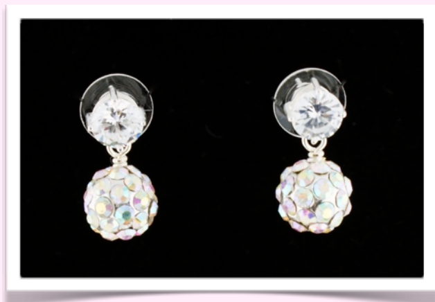
SN1166 - $53.00

7 Inches extends to 8. 12 mm Swarovski crystal balls, available in clear ab (shown), clear and lt. grey.