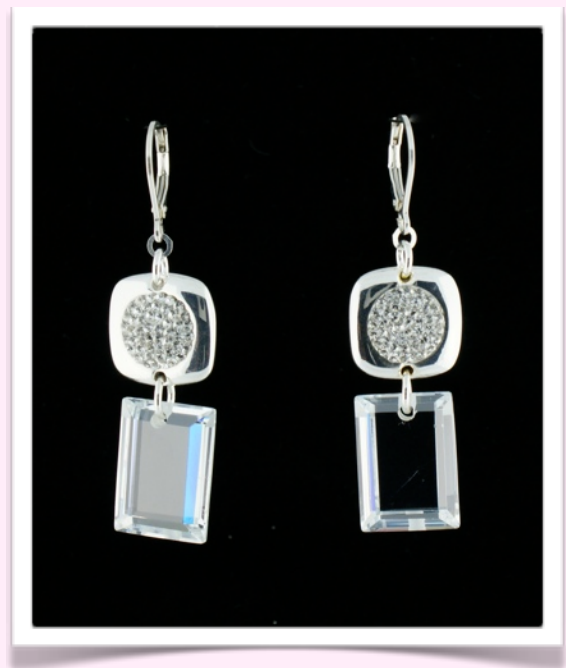
SN1137 - $92.00

16 Inches extends to 18 sterling silver chain, Swarovski pave filled square with 16 mm cubic zirconia baguette. Available in clear (shown), clear ab, lt. blue, lt. rose, yellow and peridot.