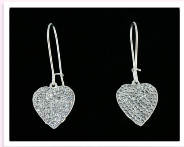
SN1106 - $90.00

Approx. 1 inch. 18mm pave heart set with Swarovski crystals. Available in most colours on Swarovski colour chart at the back of the catalogue.