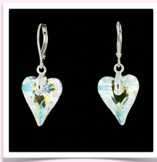
SN1163 - $57.00

18 Inch Swarovski channel crystal ab chain, New! 27 mm Wild Heart by Swarovski which can be removed so you can wear other pendants or no at all.