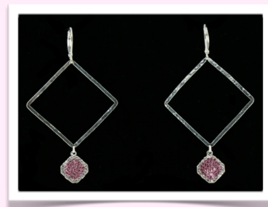
SN1145 - $92.00

Approx. 1.5 inches. Sterling silver patterned open ovals with 18 mm Swarovski tears. Available in lt. rose (shown), aqua, crystal ab, tanzanite, clear and lt. colorado topaz.