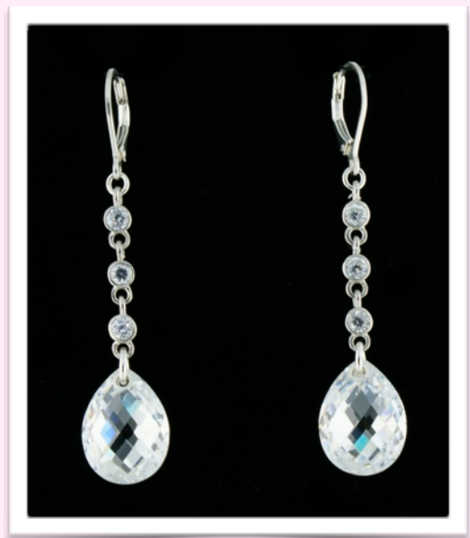
SN1117 - $94.00

16 inches extends to 19. All sterling silver. 4mm and 6mm sterling silver bezel set cubic zirconia. AAA 12x9mm cubic tears with silver rivets in the holes.