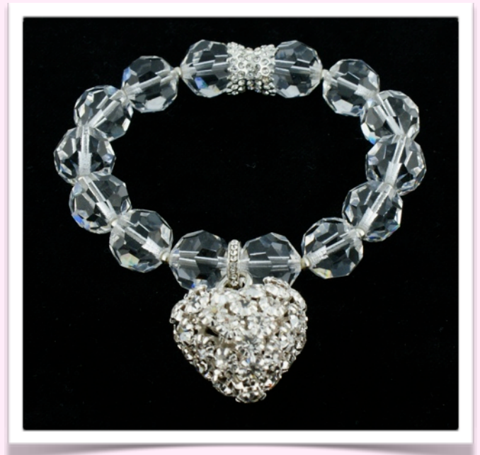
SN1159 - $70.00

Sterling filled 10 mm balls with a 2 sided Swarovski pave heart. Available in most colours on the Swarovski colour chart at the back of the catalogue.