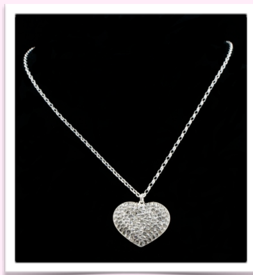
SN1105-BACK - $75.00

Sterling silver extends to 19 inches. 28mm Heart with air blue opal crystals flown in from Swarovski in Austria - Exclusive to KLD. This pendant can be worn with colour on one side ex: Air blue and the other side clear pave Swarovski stones, 2 looks for the price of one. Available in most colours on Swarovski colour chart at the back of the catalogue.