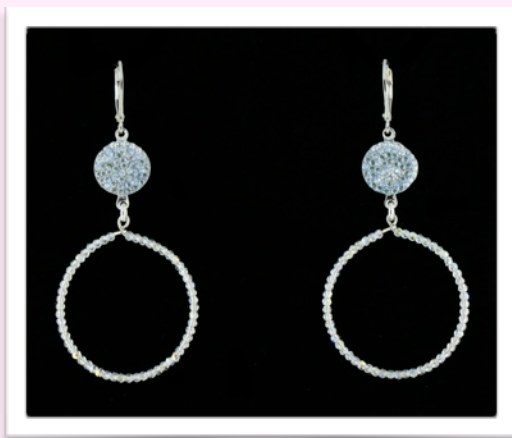
SN1156 - $105.00

7 Inches extends to 8. All sterling silver. 10 mm, 12 mm Swarovski crystals and 10 mm, 12 mm semi-precious quartz crystals.