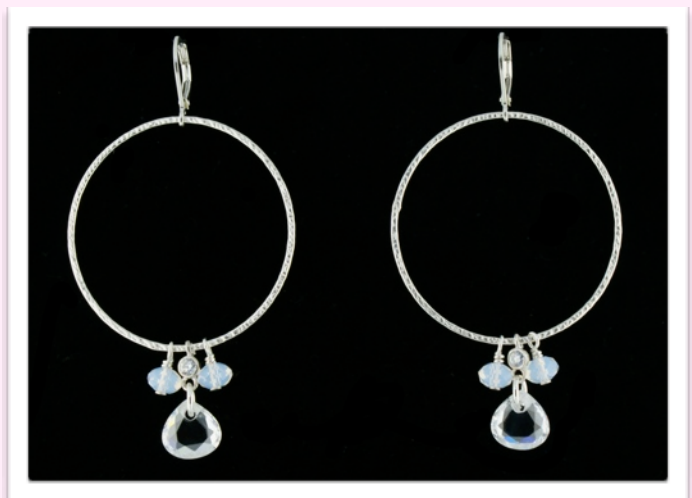
SN1148 - $105.00

40 mm patterned hoops with 6 mm Swarovski crystal accents, a sterling cubic drop and 12 mm diamond cut AAA cubic zirconia tear.