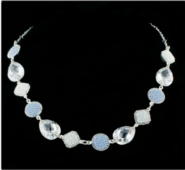
SN1101 - $367.00

Sterling silver, extends to 19 inches. Tear shaped AAA cubic zirconia with sterling rivets. Air blue opal and white opal crystals from Swarovski in Austria - Exclusive to KLD. Available in most colours on Swarovski colour chart at the back of the catalogue.