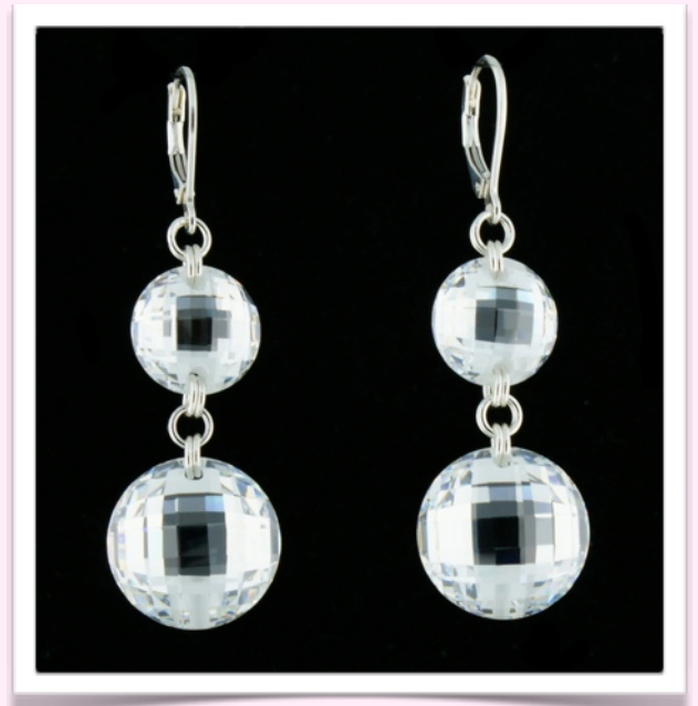
SN1126 - $88.00

16 Inches extends to 19. 12 mm and 16 mm checker board circle AAA cubic zirconia with channel set Swarovski chain. 30 mm Accent bead with the new checker board Swarovski cabachon and on the other side Swarovski pave set stones.