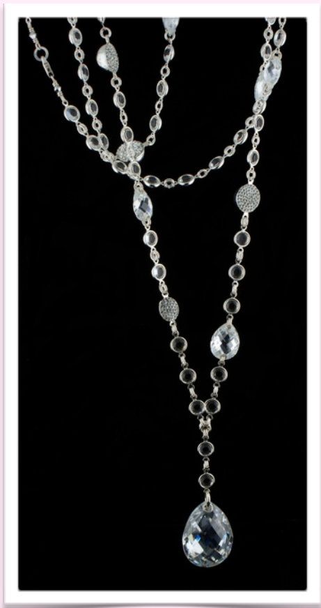
SN1120 - $475.00

Approx. 56 Inches. 30 x 22 mm and 12 x 9 mm tear shaped AAA cubic zirconia with sterling rivet in drill holes. 12 mm and 16 mm oval pave set clear Swarovski crystals. Channel set clear Swarovski chain. Available in clear (shown), jet, rose, and clear ab.