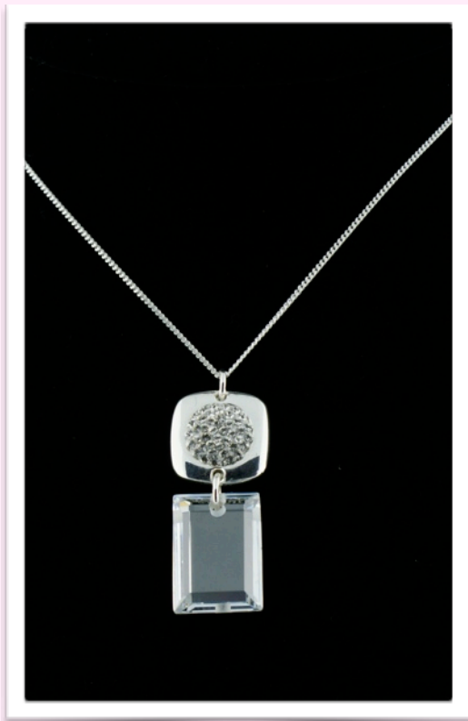
SN1136 - $66.00

16 Inches extends to 18 sterling silver chain, Swarovski pave filled square with 16 mm cubic zirconia baguette. Available in clear (shown), clear ab, lt. blue, lt. rose, yellow and peridot.