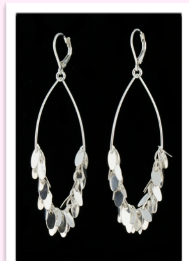
SN1152 - $88.00

Approx. 2 inches, all sterling silver with 14 mm Swarovski crystals. Available in lt. rose (shown), aqua, lt. colorado topaz, jet, clear and clear ab.