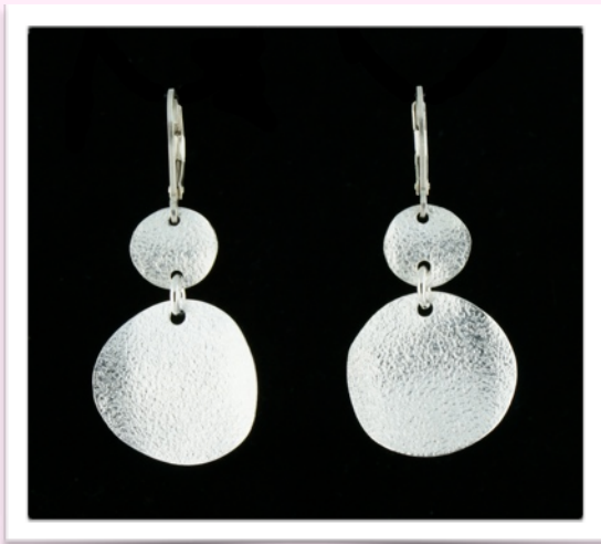
SN1149 - $62.00

40 mm patterned hoops with 6 mm Swarovski crystal accents, a sterling cubic drop and 12 mm diamond cut AAA cubic zirconia tear.