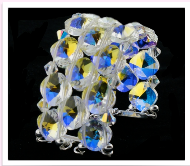
SN1164 - $211.00

17 mm New! Wild hearts by Swarovski, all sterling silver.