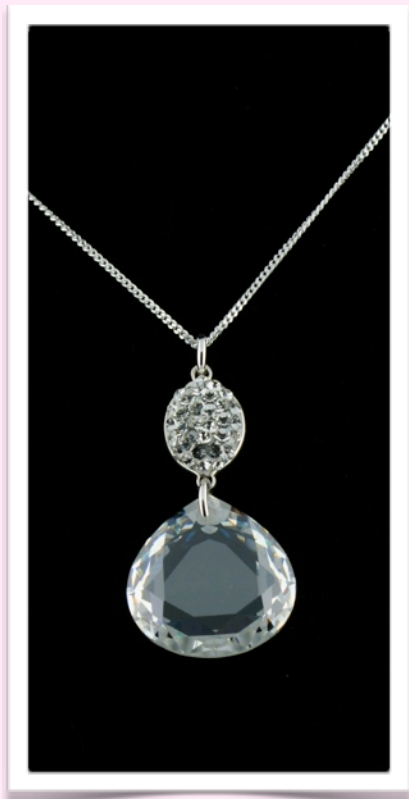
SN1167 - $66.00

16 Inches extends to 18 sterling silver chain. 16 mm Diamond cut tears with double sided Swarovski pave oval. Available in clear (shown) yellow, lt. pink, aqua, yellow, lt. sapphire and jet.