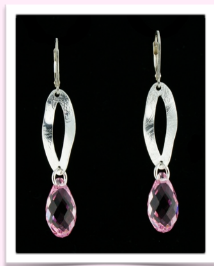
SN1146 - $70.00

10 mm Hexagon and 18 mm circle, rose opal and white opal crystals flown in from Swarovski in Austria - Exclusive to KLD. All pave set shapes are double sided for double the beauty. Available in most colours on the Swarovski colour chart at the back of the catalogue.