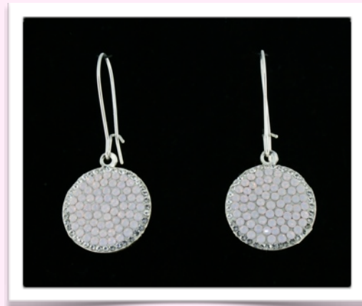
SN1109 - $92.00

Approx. 1 inch. Sterling silver kidney shape ear wire. Circle is 18mm, pave set air blue opal crystals right from Swarovski in Austria - Exclusive to KLD. Available in most colours on Swarovski colour chart at the back of the catalogue.