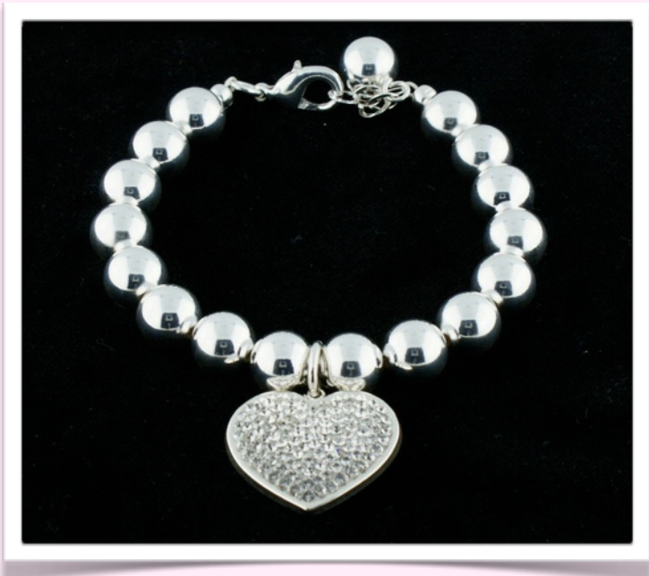
SN1158 - $96.00

Sterling filled 10 mm balls with a 2 sided Swarovski pave heart. Available in most colours on the Swarovski colour chart at the back of the catalogue.