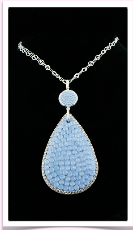
SN1108 - $255.00

Sterling silver 36 inch lacy chain that converts to 18 inches. Tear is Approx. 50mm, pave set air blue opal crystals from Swarovski in Austria - Exclusive to KLD. Available in most colours on Swarovski colour chart at the back of the catalogue.