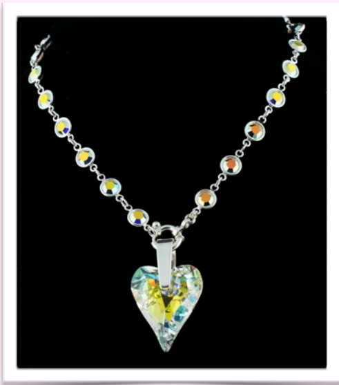
SN1162 - $136.00

18 Inch Swarovski channel crystal ab chain, New! 27 mm Wild Heart by Swarovski which can be removed so you can wear other pendants or no at all.