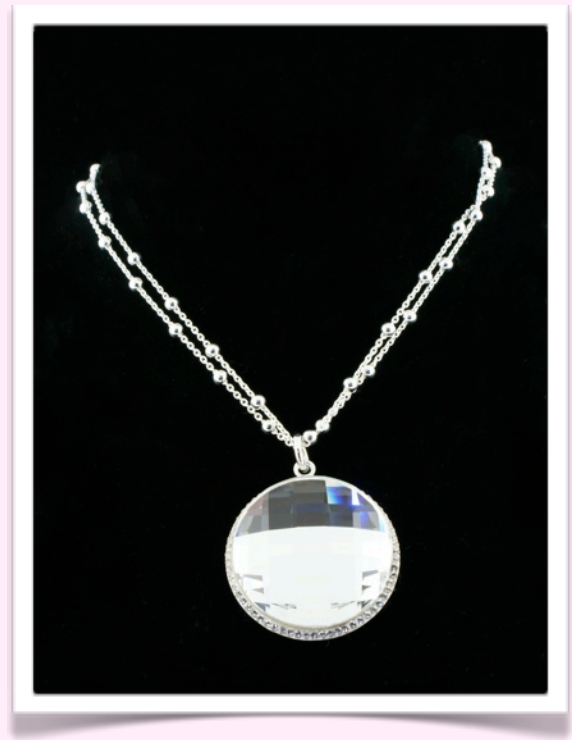
SN1111 Back - $189.00

Sterling silver 36 inch ball chain that converts to 18 inches. Circle is 30mm, pave set air blue opal crystals from Swarovski in Austria - Exclusive to KLD. This pendant can be worn with colour on one side ex: air blue opal and the other side is the new 30mm checker board cabachon crystal by Swarovski, 2 looks for the price of one. Available in most colours on Swarovski colour chart at the back of the catalogue.