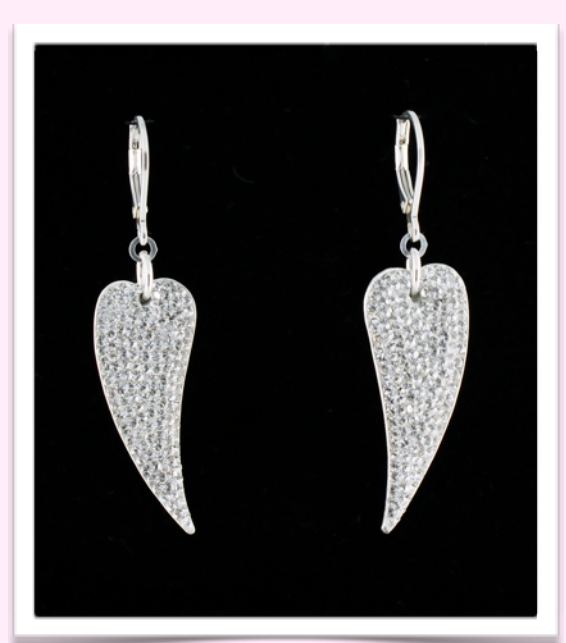
SN1161 - $101.00

7 Inches extend to 8. 12 mm Preciosa crystal balls, 14 mm Semi-precious round crystal quartz. 16 mm crystal hearts and 20 mm rhinestone center heart. Sterling fill chain.