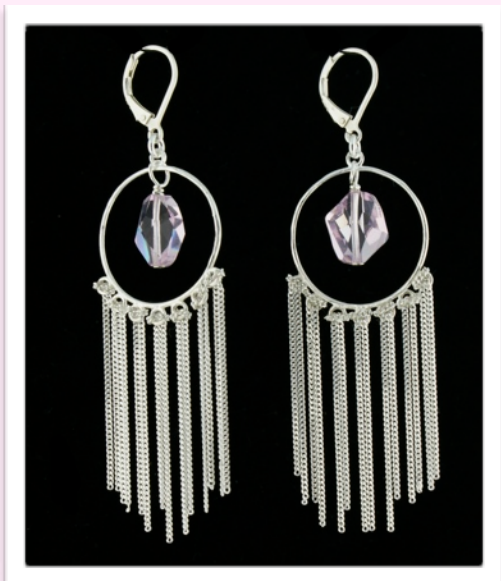
SN1151 - $83.00

Approx. 2.5 inches, all sterling silver. 16 mm and 24 mm open circles.