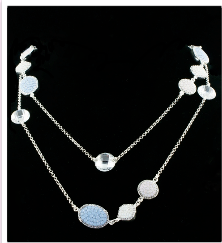
SN1113 - $484.00

Approx. 56 inch sterling silver chain. 10 mm hexagons, 12 mm circles and 18 x13 mm ovals set with air blue opal, rose water opal and white opal crystals from Swarovski in Austria - Exclusive to KLD. AAA 12mm checker board cubic zirconia accents. All pave set shapes are double sided for double the beauty