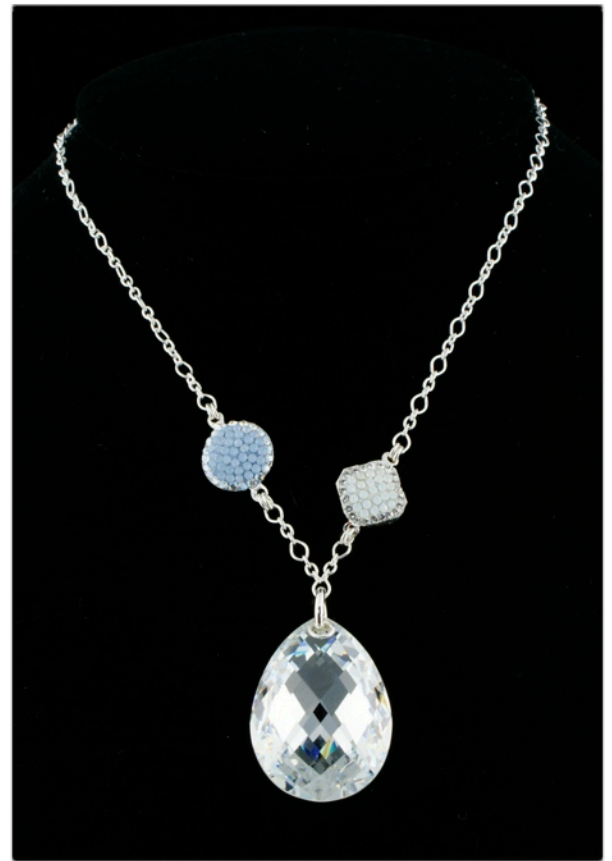
SN1103 - $156.00

Sterling silver, 7 inches extends to 8. Tear shaped AAA cubic zirconia with sterling rivets. Air blue opal and white opal crystals from Swarovski in Austria - Exclusive to KLD. Available in most colours on Swarovski colour chart at the back of the catalogue.