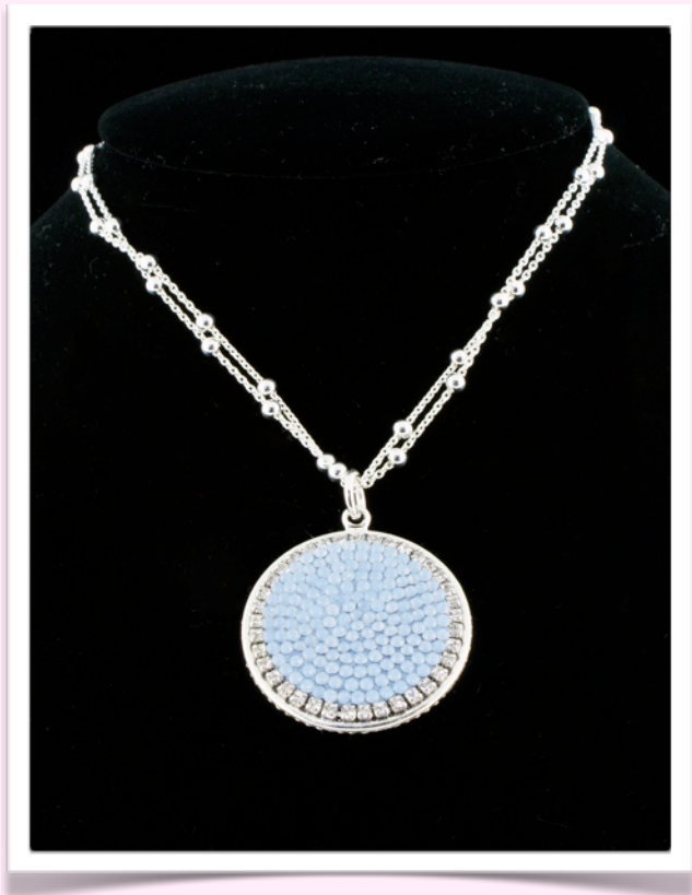
SN1111 - Front - $189.00

Sterling silver 36 inch ball chain that converts to 18 inches. Circle is 30mm, pave set air blue opal crystals from Swarovski in Austria - Exclusive to KLD. This pendant can be worn with colour on one side ex: air blue opal and the other side is the new 30mm checker board cabachon crystal by Swarovski, 2 looks for the price of one. Available in most colours on Swarovski colour chart at the back of the catalogue.