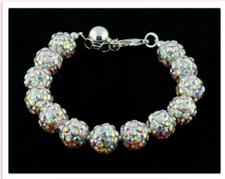
SN1165 - $92.00

7 inches extends to 8. 14 mm New Square bead by Swarovski. Available in silver shade night, crystal ab (shown), rosaline, lt. sapphire, golden shadow and jet.