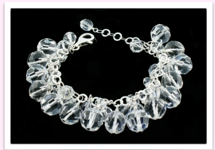
SN1155 - $193.00

7 Inches extends to 8. Sterling filled chain. Silver plated 16 mm acrylic balls with 12 mm and 14 mm Preciosa crystals and crystal balls.