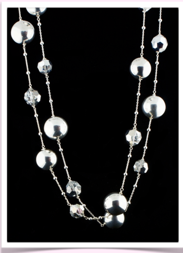
SN1153 - $202.00

Approx 56 inches. Sterling silver ball chain. Silver plated acrylic 16 mm balls with 12 mm and 14 mm Preciosa crystals