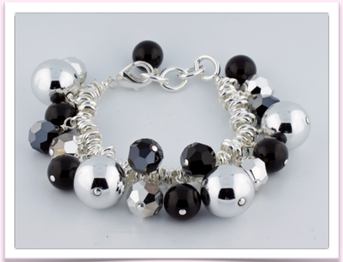
SN1169 - $75.00

16 mm Diamond cut tears with double sided Swarovski pave oval. All sterling silver. Available in clear (shown) yellow, lt. pink, aqua, yellow, lt. sapphire and jet.