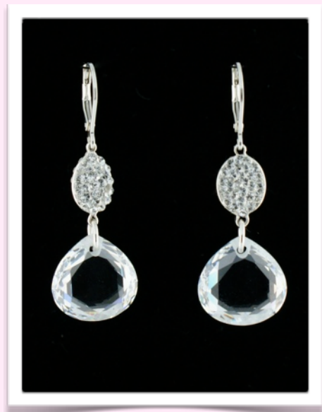
SN1168 - $70.00

16 Inches extends to 18 sterling silver chain. 16 mm Diamond cut tears with double sided Swarovski pave oval. Available in clear (shown) yellow, lt. pink, aqua, yellow, lt. sapphire and jet.