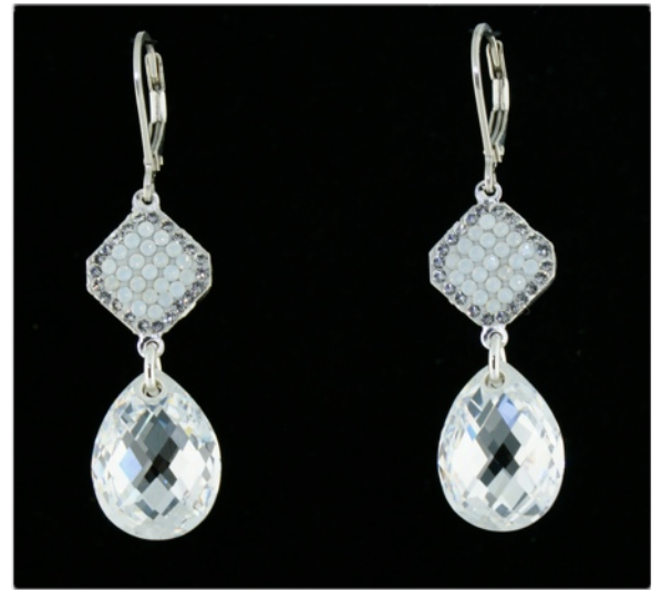
SN1104 - $130.00

Sterling silver extends to 19 inches. 30 x 22 mm tear shaped AAA cubic zirconia with sterling rivet in drill hole. Air blue Opal and White opal crystals from Swarovski in Austria - Exclusive to KLD. All pave set shapes are double sided for double the beauty. Available in most colours on Swarovski colour chart at the back of the catalogue.