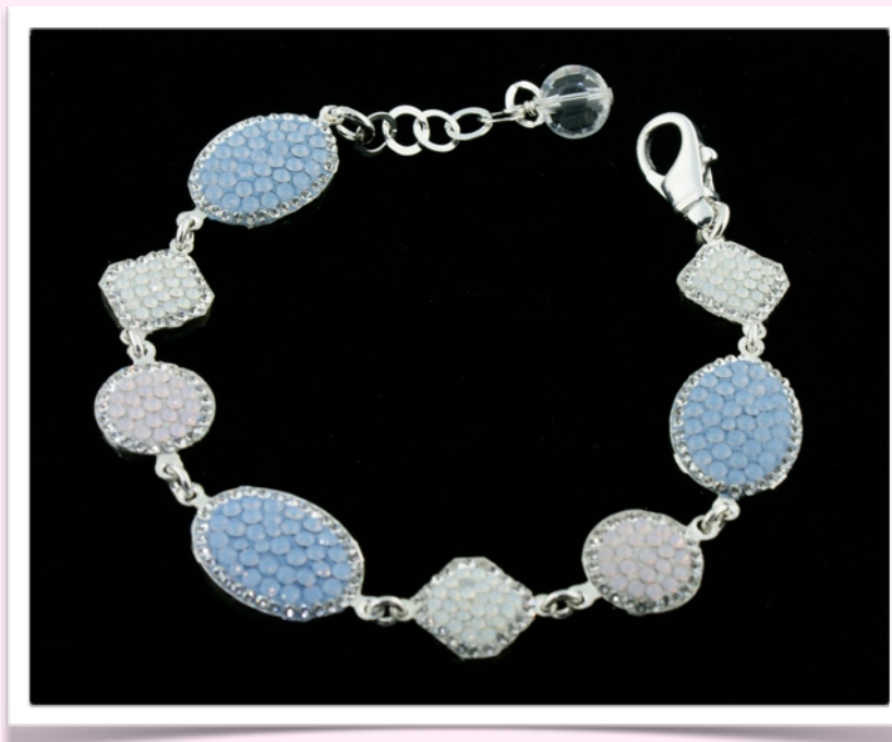
SN1115 - $215.00

Sterling silver approx. 2 inches long. 10 mm hexagons, 12 mm circles and 18 x13 mm ovals set with air blue opal, rose opal and White opal crystals flown in right from Swarovski in Austria - Exclusive to KLD. All pave set shapes are double sided for double the beauty.