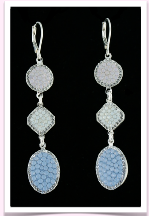
SN1114 - $189.00

Sterling silver approx. 2 inches long. 10 mm hexagons, 12 mm circles and 18 x13 mm ovals set with air blue opal, rose opal and White opal crystals flown in right from Swarovski in Austria - Exclusive to KLD. All pave set shapes are double sided for double the beauty.