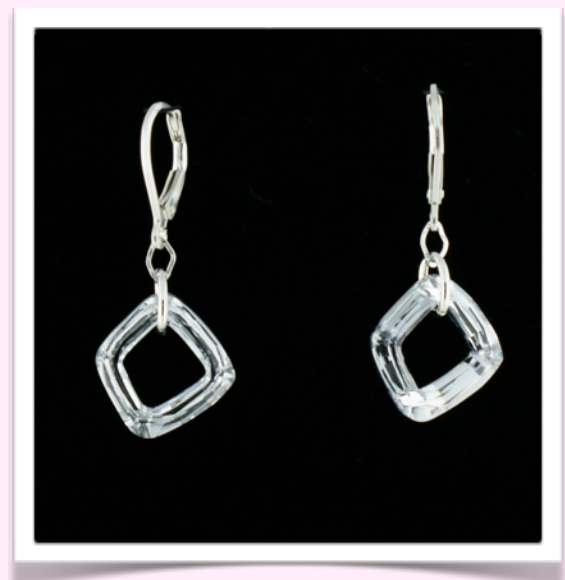
SN1139 - $57.00

16 Inches extends to 18 sterling silver chain, Swarovski pave filled square with 20 mm NEW Swarovski crystal cal cosmic pendant. Available in crystal cal (shown), lt. colorado topaz, jet, bermuda blue and shadow crystal.